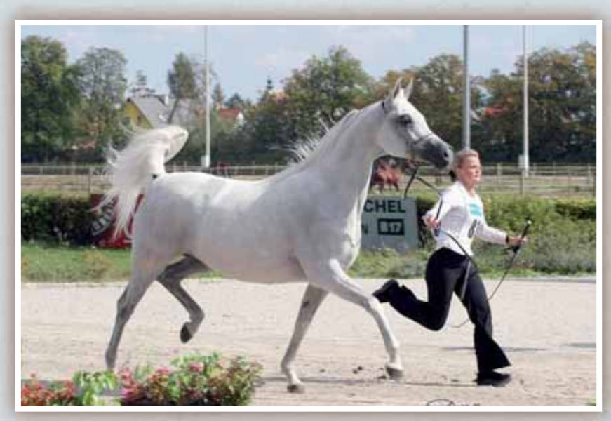
PUSTYNNA DROGA (LAHEEB x TARCZA DROGA) mother of MARJAN ALBIDAYER shown to Champion Mare title in Baden by Wien 2008, 3 x 20 in movement